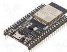
Fig. 2. ESP 32 - Microcontroller and Wifi

The ESP32 is a low-cost, low-power microcontroller series with Wi-Fi and Bluetooth capabilities, as well as a highly integrated structure driven by a dual-core Tensilica Xtensa LX6 microprocessor. This paper compares the ESP32 to some of its competitors on the market and introduces the microcontroller's specifications, features, and programming details. The embedded memory is 448KB ROM, 520KB SRAM and has two 16KB RTC memory. [7]