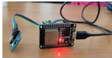
Fig. 5. Hardware implementation

Initially we login using the credentials (Has to be created for a new user). Later, he can track the patients based on his/her gesture through the “track” tab in the website.