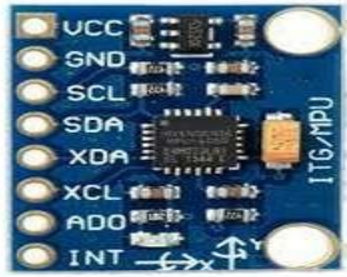
Fig. 3. MPU6050 - Gyroscope and Accelerometer

Firebase - Firebase Realtime Database - Publish and retrieve Data Firebase is a platform for developing web applications. It aids developers in the creation of high-quality apps. It saves data in the JavaScript Object Notation (JSON) format, which eliminates the need for queries when inserting, updating, deleting, or adding data. It's the part of a system that acts as a database for storing information.[9]