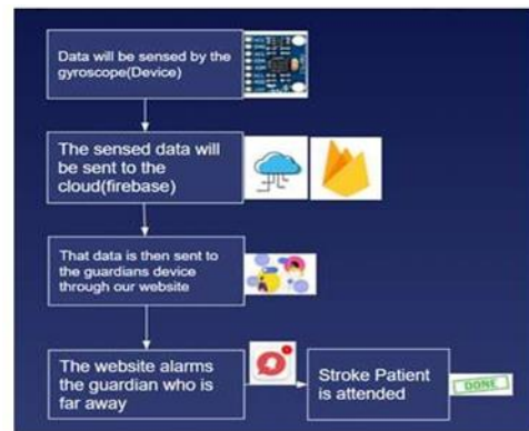
Fig.1. Block Diagram of the overall Device Mechanism

A gyroscope sensor works on the principle of Conservation of Angular Momentum. It works by preserving the angular momentum. In a gyroscope sensor, a rotor or a spinning wheel is mounted on a pivot. Whenever we spin the rotor of the gyroscope, the gyroscope will continue to point in the same direction.