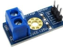
Figure:4. Voltage Sensor

The voltage sensor (shown in figure-4) measures the voltage levels across the supercapacitor bank and the lithium-ion battery. The Arduino Nano uses this data from voltage sensor and to manage charging and discharging effectively, ensuring system stability.