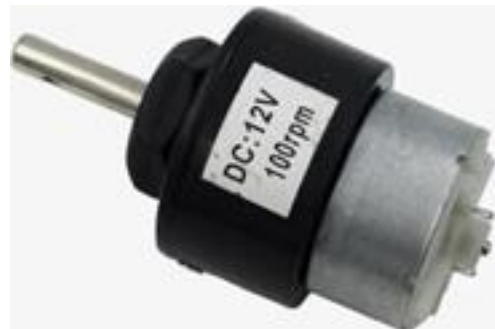
Figure:6. Motor (12V/ 100 rpm)

The system uses Two Motors (shown in figure-6) that work as the primary units. They are powered by either the supercapacitor bank or the lithium-ion battery, depending on the power requirements.