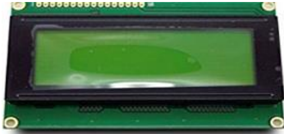
Figure:7. 20x4 LCD Display

The 20x4(alpha-numeric) LCD display (shown in figure-7) shows real-time information such as the voltage levels of the battery and supercapacitor bank, the current supplied to the motors, and system alerts. This helps the user monitor the status and performance of the hybrid system.