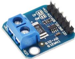
Figure:3. Current Sensor (INA219)

The current sensor (INA219) (shown in figure-3) is used to monitor the current flowing through the system, it provides feedback to the Arduino Nano.