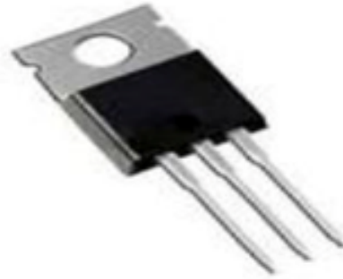
Figure:5. MOSFET drive (IREZ44N)

The MOSFET drive (IRFZ44N) (shown in figure-5) is controlled by Arduino Nano and manage power flow between the supercapacitor bank, battery, and motors. The MOSFET acts as an electronic switch, it's allowing control of current flow.