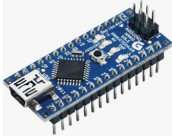
Figure:1. Arduino Nano

20 supercapacitors (shown in figure-2) are connected in series to form a supercapacitor bank that provides the necessary voltage for high-power operations. Supercapacitors offer rapid charging and discharging.