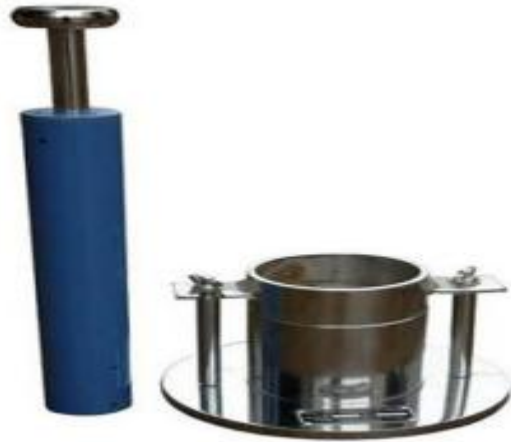
Fig 3.1.Modified Proctor test apparatus

Proctor Test is essentially for determination of the relationship between the moisture substance and dry density of soils compacted in a mould of a given size with a 2.5 kg rammer dropped from a stature of 30 cm. It is a research center test system for experimentally deciding the optimum moisture content (OMC) at which a given soil sorts will get most thick and accomplish its maximum dry density (Yd). The name Proctor is given out of appreciation for R. R. Proctor for demonstrating that the dry density of soil for a compactive exertion relies on upon the measure of water the soil holds throughout soil compaction in 1933. His unique test is most generally alluded to as the standard Proctor compaction test, which recently was overhauled to make the new compaction test. That is Modified Proctor Test.