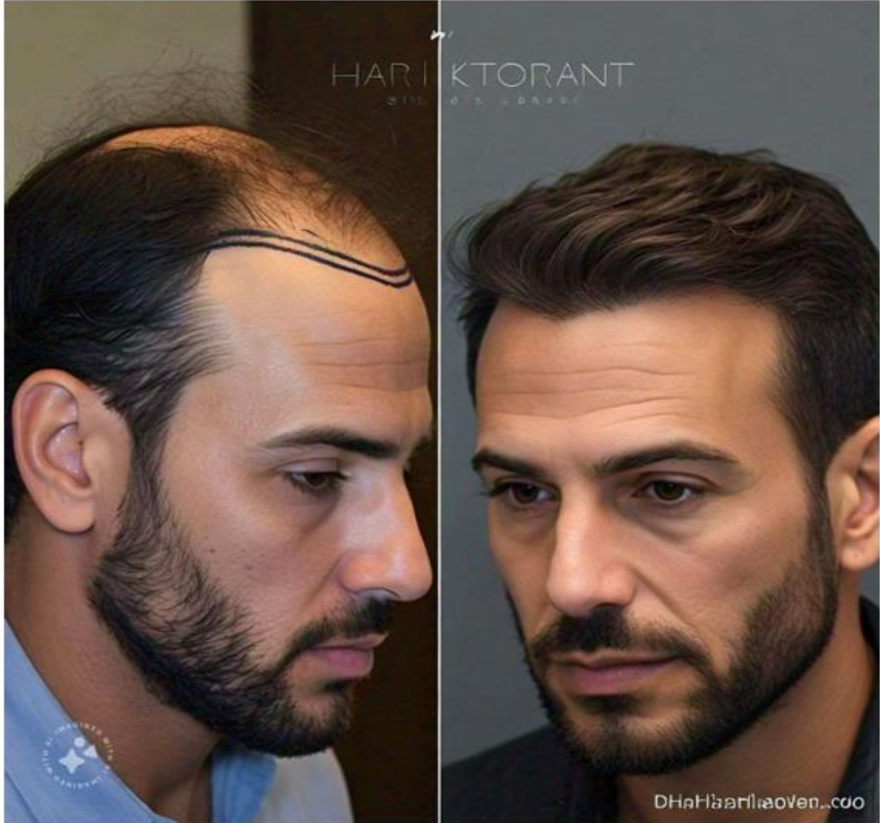
Fig. 3: – hair Transplantation

It is important to remember that a patient is worse off after a poorly performed hair replacement surgery. If done judiciously, transplantation is a very rewarding procedure, both for the surgeon and the patient