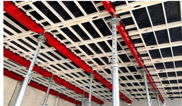
Fig-2 Image representation of a AluDeck type of formwork system

While AluDeck formwork offers numerous benefits, challenges such as the need for specialized training and higher upfront costs may deter some contractors from its adoption. However, the long-term advantages often outweigh these initial hurdles, positioning AluDeck as a forward-thinking solution in the construction industry (Youfeng Xiao, 2021).