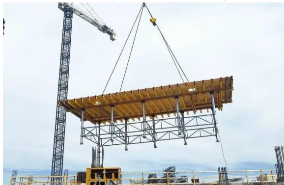
Fig-1 Image representation of a table type of formwork system

Table formwork, also known as flying formwork or table forms, is a type of formwork system used for large floor slabs in multi-story buildings. It consists of large prefabricated, reusable formwork tables that can be quickly moved from one floor to the next, speeding up construction (Koo et al., 1994). Concrete slabs are supported by table formwork while they are being poured and allowed to cure. It usually comprises of a table-like framework with vertical and horizontal supports that the concrete is poured over. For big, recurring floor structures, this formwork technique works well because it gives workers and equipment a firm platform. A supported and appropriately formed slab is left behind after the formwork is removed once the concrete has set (Bhilwade et al., 2023).