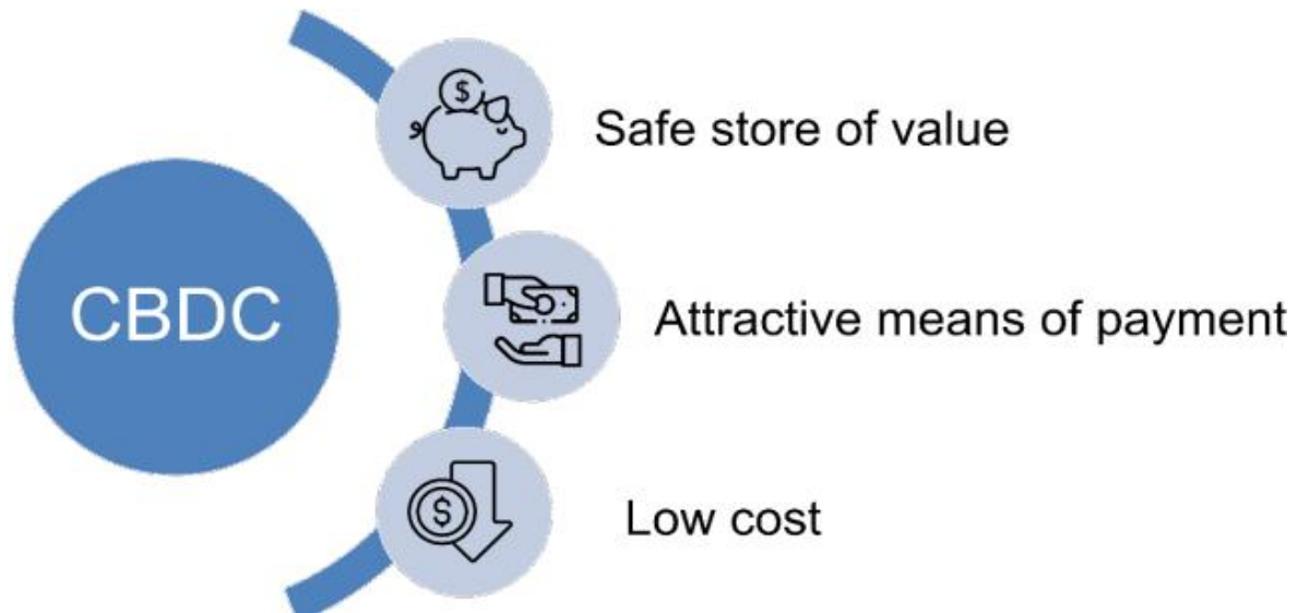
FIGURE 1. FEATURES OF CBDCS

of this population residing in Sub-Saharan Africa. Due to their minimal adoption costs and internet accessibility without requiring a physical bank, cryptocurrencies present a simple and secure alternative. A significant portion of the unbanked lacks clear identifying information, complicating the enforcement of conventional banking Know Your Customer and Anti-Money Laundering protocols. With a smartphone and internet access, individuals can utilize cryptocurrencies for monetary transactions, which typically incur substantially cheaper fees than conventional methods. The transfer is rapid and secure, with minimal impediments to entrance. It also offers an alternative remedy in nations experiencing hyperinflation. Central Bank Digital Currencies (CBDCs) possess the capacity to enhance the payments and financial system by introducing a novel form of digital currency characterized by the following attributes (Figure 1):