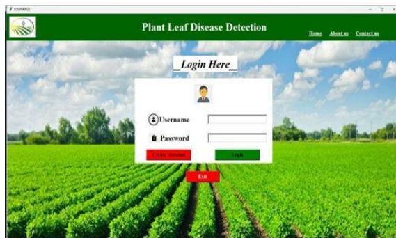
Fig. 3. Inference output example: detected persons (green boxes), helmets (blue), vests (orange), pose key points (red), and compliance status labels.