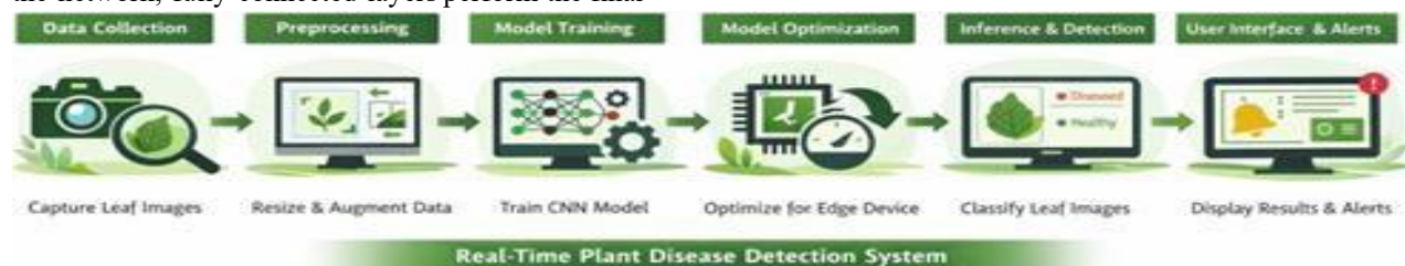
Fig. 1. High-level system architecture for real-time plant disease detection.

Figure 1 shows the overall system architecture of the proposed real-time plant disease detection system. The architecture splits into two main operational phases: training and inference. The training phase runs on a high-performance workstation or GPU-enabled system, while the inference phase is optimized for use on low-cost edge devices.