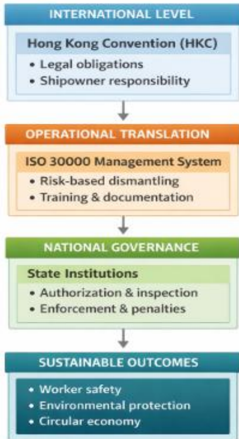
Figure 2: Integrated Compliance Framework for Sustainable Ship Recycling

These findings challenge yard-centric compliance narratives and shift responsibility toward national environmental infrastructure planning. Without addressing downstream capacity, HKC implementation risks becoming symbolic rather than substantive.