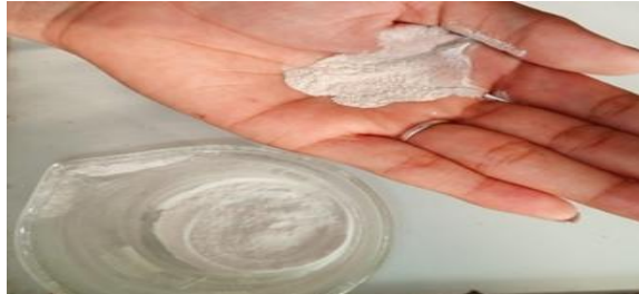
Fig: Extracted starch from potato peels waste

Bio plastic preparation method: Bioplastic is an alternative for traditional plastic and can help reduce many problems. As its strength is quite low, fibres are added to the composition matrix, this increases its strength. Followed the procedure to bioplastic formation such a composite on a laboratory scale.