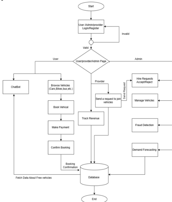
Fig. 1: Data Flow Diagram

The dynamic pricing module calculates the optimal rental price based on demand and availability. The recommendation engine analyzes user preferences and suggests alternative vehicles if necessary. The fraud detection module checks the transaction for suspicious activity before confirming the booking. After successful verification, the booking information is stored in the system database. The maintenance module updates vehicle usage records and predicts future maintenance requirements. Administrators can access analytical dashboards to monitor system performance and fleet utilization.