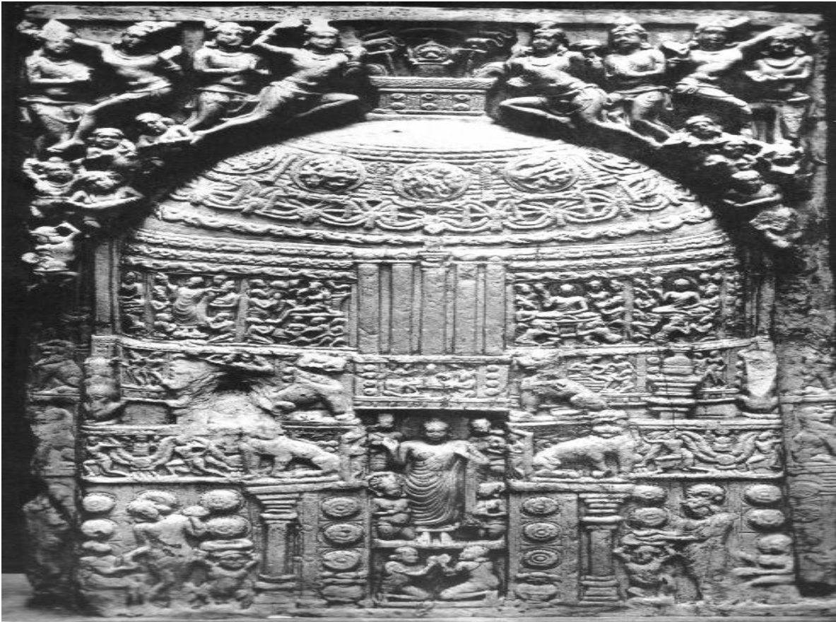
(Source: Votive slab showing a Stupa, Amaravati, (fig. 98, The Art of Indian Asia; Its Mythology and Transformations , vol. 2, plates; by H. Zimmer, 1968)

During this period, the dome portion of the stupa was also covered by sculptured panels. One such panel which is about 2.39 meters in height is placed in the reserve collection of the Museum and this bears an inscription of Yajna Sri Satakarni (170-198 A.D.) according to the chronology we adopted 6 . It is observed that the dome slab cited above has some carvings which lag behind the Mature phase of the Amaravati art.