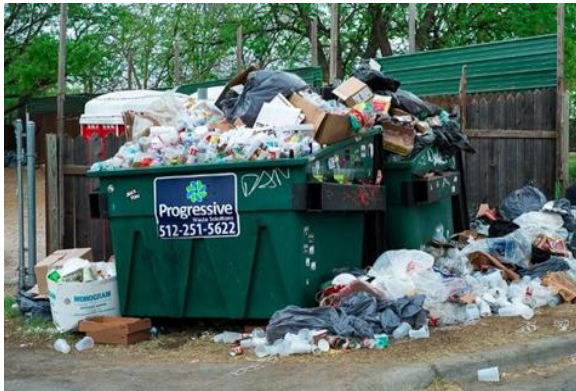
Fig.1. Overflow Garbage create pollution

Due to overfilled bins, individuals won't approach trash cans to dispose of their waste; as a result, total automation is required so that concerned parties can remotely monitor the trash cans and alert the collection vehicle to empty them when they are full, saving fuel and preventing waste spills.