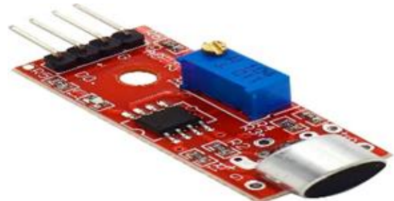
Fig3: sound sensor

A sound sensor listens to noises around it. It converts sound vibrations into electrical signals and checks how loud or soft they are. If there is a sudden loud noise