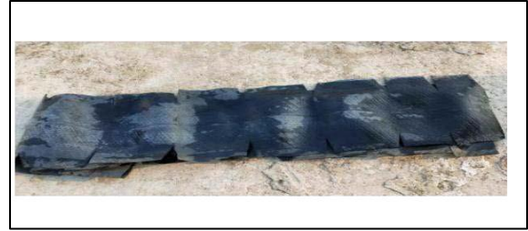
Fig 1.3 Tube rubber Matting

We design the speed breaker structure carefully for proper working. A strong base is provided at the bottom to support the load of vehicles. A hollow space is created inside to store the non-Newtonian fluid. A rubber layer is placed on top for flexibility and protection. This design helps the speed breaker work effectively at different speeds.