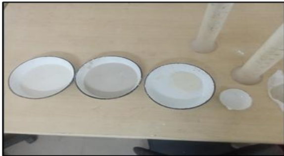
Fig 1.2 Mixed fluid

We mix corn starch and water in the correct ratio. Mix well so that there are no lumps When pressed fast → it becomes hard When touched slowly → it feels like liquid