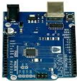
Fig.2. Arduino Uno Microcontroller