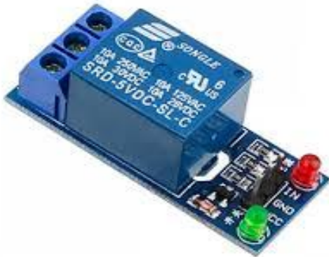
Fig.4. Relay Module