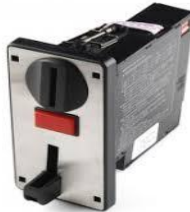
Fig.3. GD007 Coin Sensor