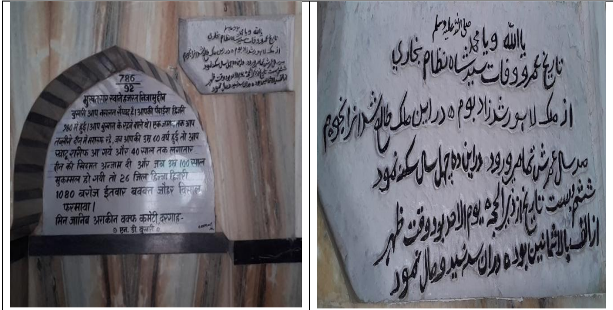
Sayyid Shah Nizam Bukhari Dargah in Chhoti Khatu (Original Inscription in Persian and translated version in Hindi)

Bukhari Dargah in Chhoti Khatu. It has an inscription (see Table-2) inscribed on the wall of the dargah 19 .