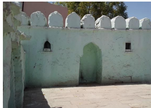
Kanati Mosque, Chhoti Khatu

It is a small town in Nagaur district of Rajasthan and is around 65 Kms away from Nagaur and about 30 Kms away from Didwana 16 . It is an archaeological site with many monuments related to different sects and