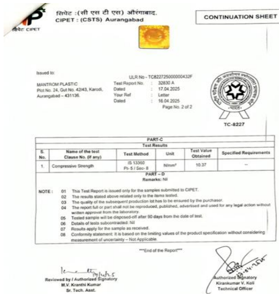
Fig. 1. Certified compressive strength test report of plastic-based grass block (CIPET).