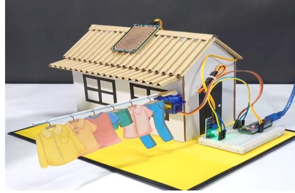
Figure2: Hardware output of smart retractable clothesline system using IoT

remotely, confirming the effectiveness of IoT functionality.