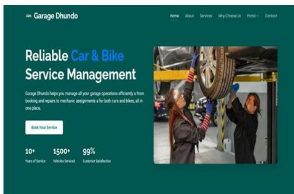
Fig.3: Result Analysis