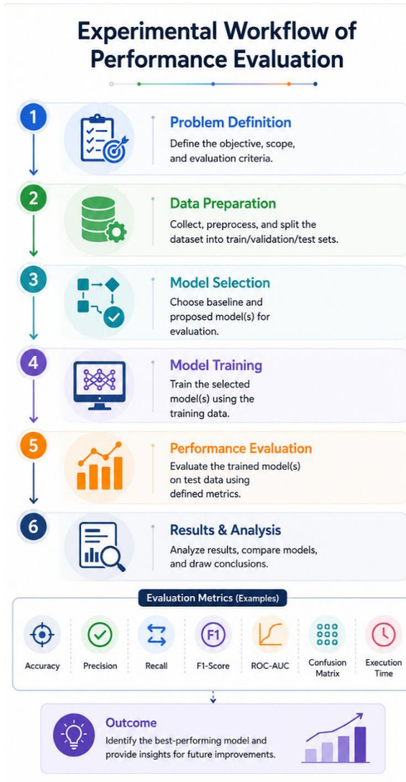
Fig. 2. Experimental Workflow of Performance Evaluation

The experiments were conducted using distributed virtual machines and containerized microservices deployed across multiple cloud simulation environments.