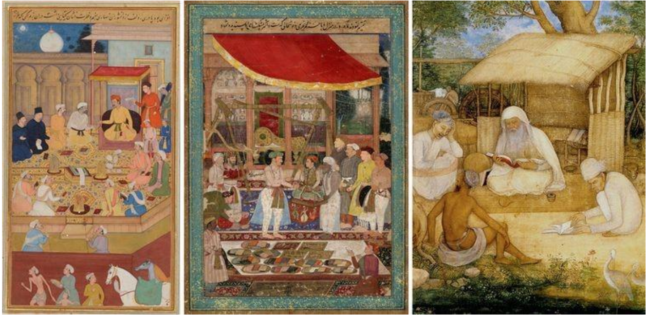
Figure 2&3. Akbar holds a religious assembly at Fatehpur Sikri in his Ibadat Khana, Fatehpur Sikri. Figure 4. Court astrologer interpreting a royal horoscope in the Mughal court tradition.