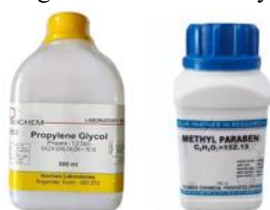
Fig 6 Propylene glycol & Methyl paraben