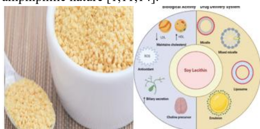
Fig 3 Soy Lecithin

Soy lecithin is a natural phospholipid mixture, mainly composed of phosphatidylcholine. It is widely used in nano-delivery systems due to its biocompatibility and amphiphilic nature [1,11,14].