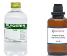
Fig 5 Glycerin & Triethanolamine

Triethanolamine (AR Grade) – pH Adjuster