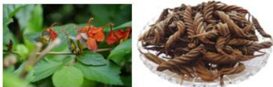
Fig 2 Helicteres isora