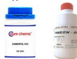
Fig 4 Carbopol 934 & Tween 80