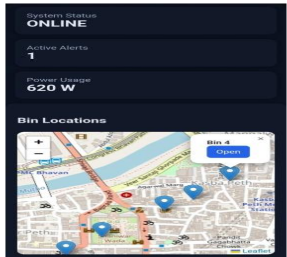
Figure 5 Bin Location Monitoring Dashboard

The experimental observations indicated that lightweight waste materials such as paper pieces, plastic wrappers, and dry leaves were effectively transported through the pipeline system. The average transportation efficiency was observed to be approximately 95%.