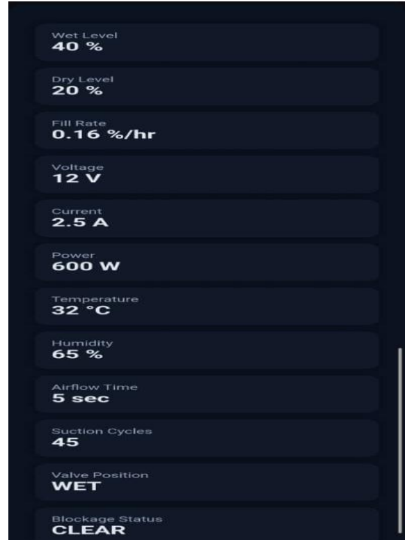
Figure 4 Real-Time Bin Monitoring Dashboard

The vacuum pump was tested for transporting lightweight waste materials through the PVC pipeline network. The pump generated sufficient suction force to move waste from the disposal unit to the centralized collection chamber. The transportation process was completed successfully without major blockages during testing. The underground transportation mechanism reduced direct human contact with waste and improved overall hygiene.