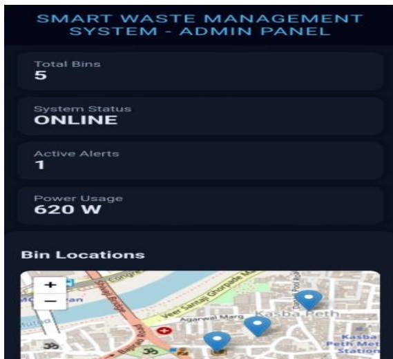
Figure 3 Admin Panel

The ESP32 controller continuously monitored the garbage level through ultrasonic sensors. When the waste level exceeded the predefined threshold value, the controller automatically activated the relay module and switched on the vacuum pump. Once the waste level decreased below the threshold, the pump was turned off automatically.