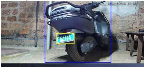
Fig. 2. YOLO-based Vehicle Detection and Classification

The model finds things and shows them in Figure 2. The system can distinguish between two types of vehicles bicycles and motorcycles. The system establishes a unique score for each detected object which indicates the level of confidence that the system possesses. The system uses rectangular boxes to display both the positions and identities of all detected objects. The system handles bicycle detection with high certainty, assigning it a detection score of 0.92. The system handles motorcycle detection with high certainty, assigning it a detection score of 0.85. The system identifies all objects which it detects as either vehicles or non-vehicles. The Vehicle Detection and Classification system demonstrates excellent vehicle detection capabilities which the YOLO algorithm effectively enhances.